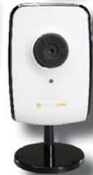
DLink® Web Enabled Camera

Static IP Address for set-up and configuration