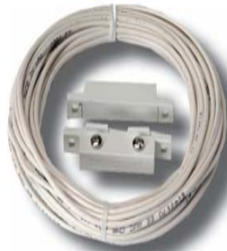
Door Position Sensor

Optional Remote Sensors - Connect via I/O Port