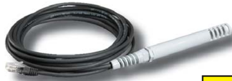
Temperature, Humidity, & Dew Point Sensor