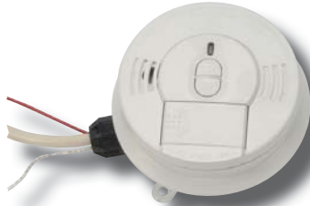
Smoke Alarm Kit