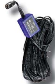
Power Fail Monitor